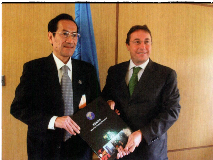
Prof. Chen Yiyu, NSFC President, met with Mr. Achim Steiner, Executive Director of UNEP.